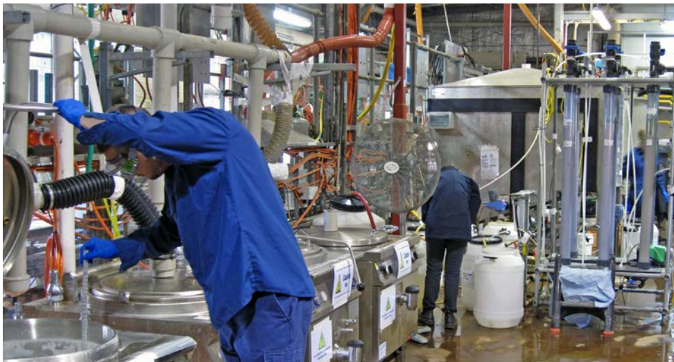
SiLeach ® pilot plant operations at ANSTO

"Granting of the US SiLeach ® patent is timely, given increased interest in the extraction of lithium from clays in north America ... and even more so now that LFP is the most rapidly expanding sector of the lithium-ion battery industry. The lithium and phosphorus required to manufacture LFP are both produced by SiLeach ® as a single lithium chemical. We invite anyone with a lithium mica or clay deposit to reach out and see what we can offer; also, cathode producers interested in discussing a more direct route to LFP synthesis using our proprietary VSPC cathode powder production technology."