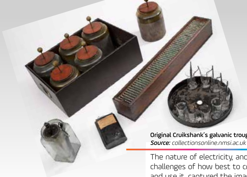
Original Cruikshank's galvanic trough.