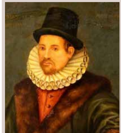
William Gilbert, the 'Father of Magnetism'.

Although primitive batteries may have existed in Babylonian times (the evidence is disputed), it wasn't until the 1550s that English scientist William Gilbert made the distinction between magnetism and static electricity (then called the 'amber effect'). Known as the 'Father of Magnetism', Gilbert is credited with establishing the study of electrochemistry.