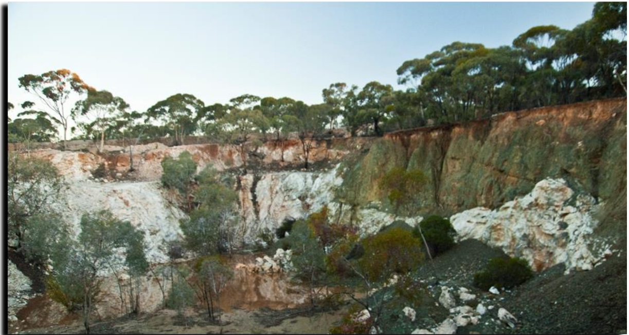
Figure 4: Thick pegmatite exposed within the walls of the Lepidolite Hill quarry, 520 km east of Perth, Western Australia.

TOMRA Sorting Solutions carried out the testwork on bulk samples obtained from dumps surrounding the historic mine workings at Lepidolite Hill. The ore-sorting tests indicate the possibility of rejecting a large proportion of the waste material, thereby reducing the required capacity of the ore-preparation section