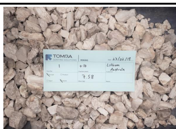
Figure 2: Ore sorting reject (mainly feldspar) from Lepidolite Hill mine dumps.

At Lepidolite Hill, the lithium mineralisation consists of petalite and lepidolite in a thick pegmatite that remains exposed in the quarry walls, with further large lepidolite accumulations exposed at surface at the southern end of the of the quarry.