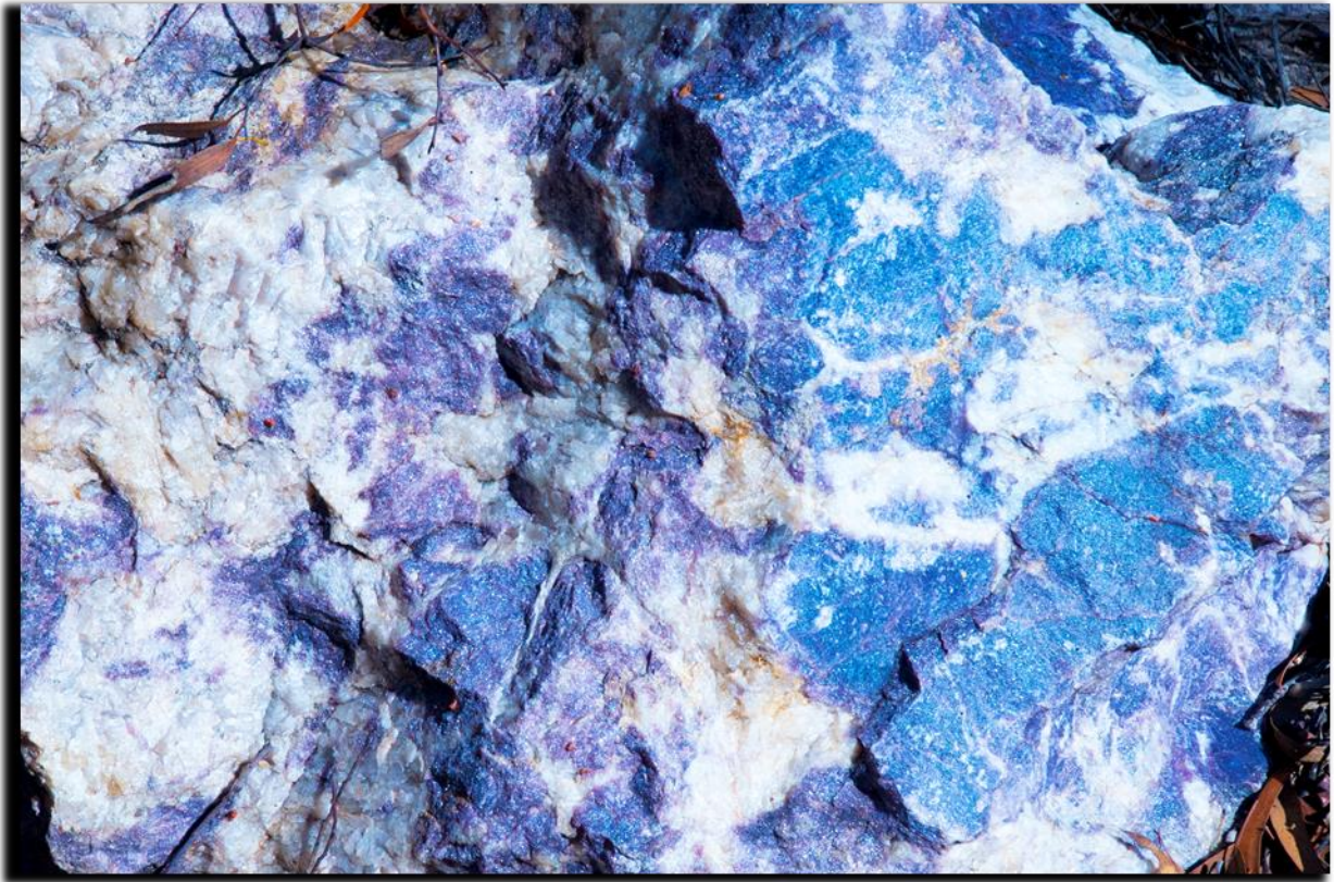
Figure 3: Lepidolite (blue-purple) with quartz, feldspar and accessory spodumene, petalite and pollucite.

In the 1970s, petalite (a lithium aluminosilicate) was recovered during mining operations but the abundant lepidolite also mined in the 400,000-tonne campaign was consigned to the dumps. That lepidolite is associated with accessory petalite, spodumene and pollucite (a cesium mineral).