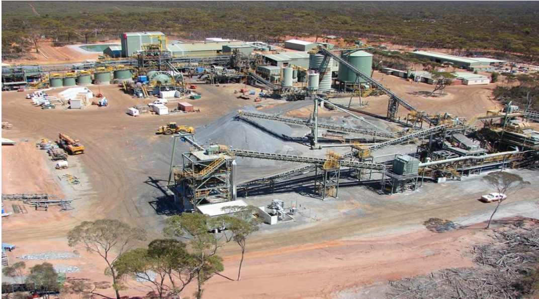
Figure 1: Poseidon Nickel's Lake Johnston concentrator.

Additional infrastructure at Lake Johnston includes existing tailings disposal cells, a bore field and water treatment plant, large mine workshop and maintenance facilities, administration buildings, functional laboratory and metallurgical laboratory, plant stores and workshop areas, medical centre and emergency response control centre. The site power is supplied by a local power station.