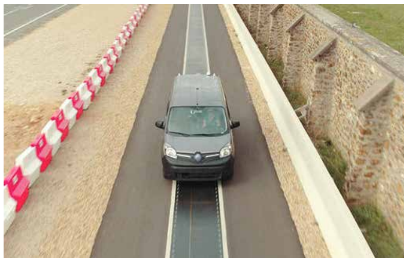
Renault Kangoo ZE testing the wireless charging road for electric cars.

Recently, in The Weekend Australian , Greg Ip opined that for EVs to entirely displace internal combustion engines (and, by extension, for lithium to oust oil), some combination of higher oil prices and cheaper battery storage is necessary. Only time will tell.