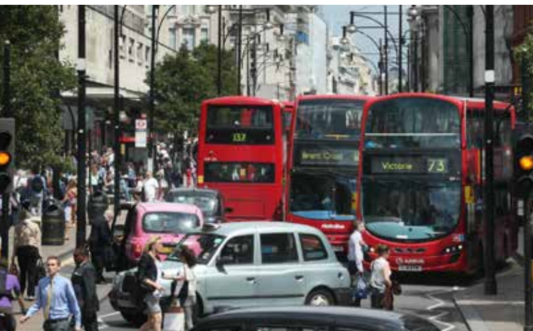
Traffic in central London